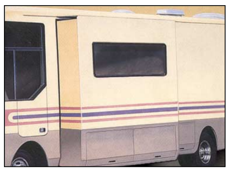
Exterior of room and coach.