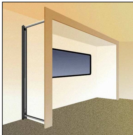
Interior view of room.