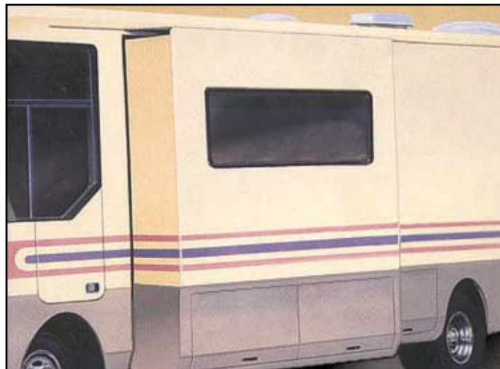
Exterior of room and coach.

HWH Dual Cylinder “Universal” Room Extension* is designed to simplify installation. New exclusive HWH Inter-Locking Chains* are used to extend and retract the room. The level-in/level-out coach floor provides for a flush floor in the coach whether the room is extended or retracted. The coach floor lowers when the room is retracted and raises when the room is extended rather than the room raising or lowering.